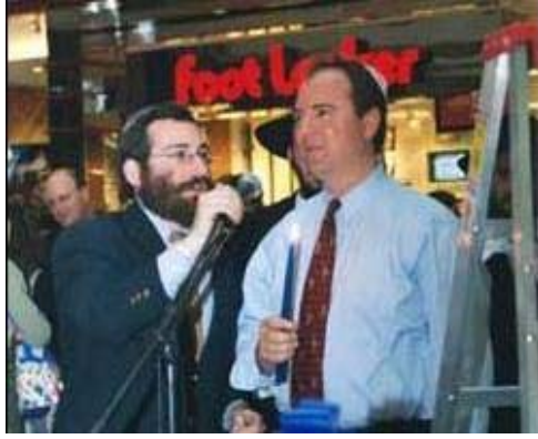
Congressman Adam Schiff

...Declares his support for the Lubavitch Movement.